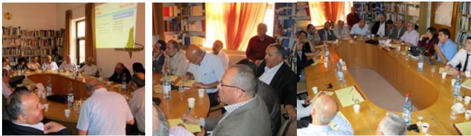
2-3 October 2010, Amman,